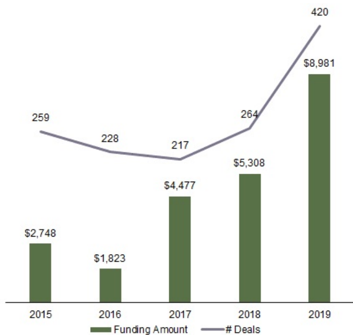
Figure 1: U.S. Financing Activity (dollars in thousands) (1)